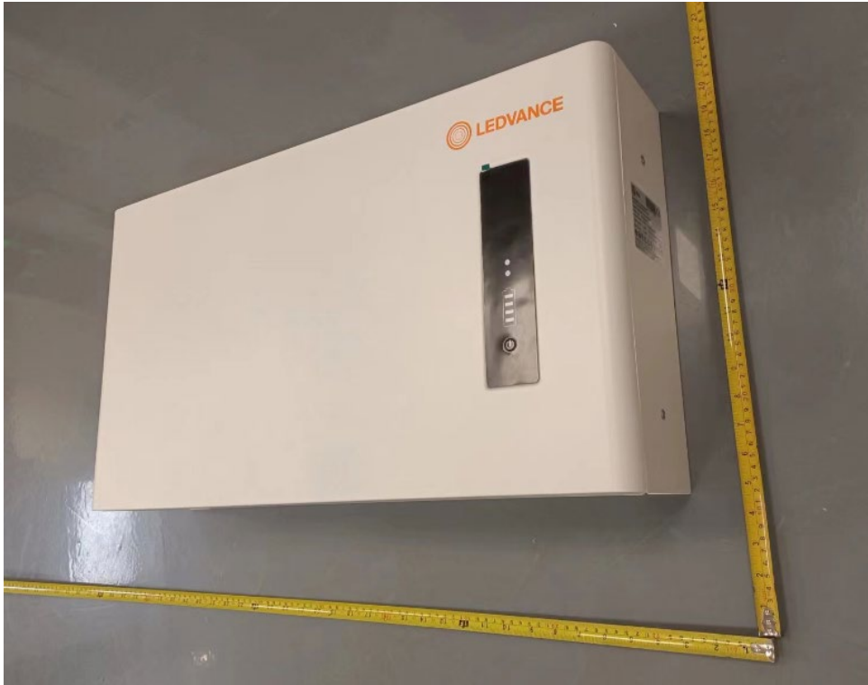
Figure 1 Overall view I of battery (外观图I)