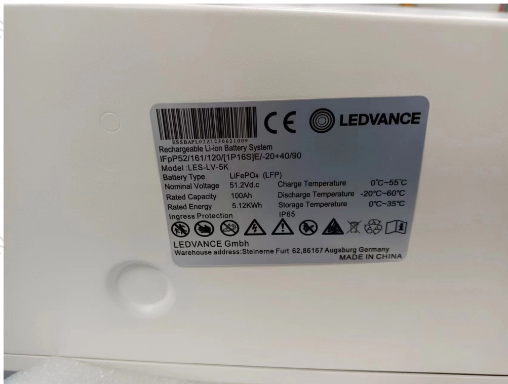
Figure 4 Battery Label (标签图)